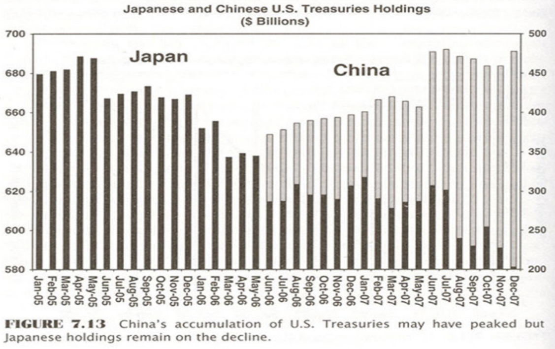
FIGURE 7.13 China's accumulation of U.S. Treasuries may have peaked but Japanese holdings remain on the decline.

I had a keen understanding back in the mid-1980s that the United States would suffer greatly once it moved from net creditor to net debtor in the world economy. This is indeed what has happened. The clock began ticking in the mid-1980s – net debtor status – and I figured we would have about 25-30 years or so before “the shit hit the fan.” I was right. I still think we have a little time left, but not much. The money printing is going to speed up our approach to total collapse. The theory in Washington is that the money printing will help us – this is bullshit, ignorant bullshit. We will soon find out how much bullshit it really is. I published in WAM in February 2009 an article which I must again refer you to. I think it serves as an excellent summary of the problem.